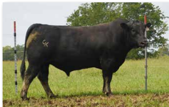
Lot 61 - CK Big Apple D873G