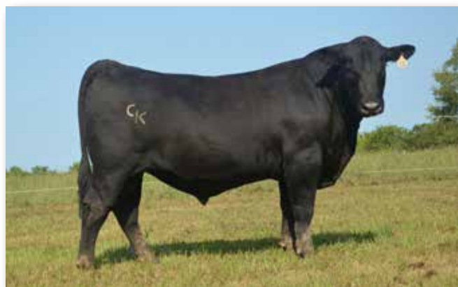
Lot 123 - CK Hard Rock C578H