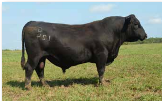
Lot 11 - CK Cowboy Up A124G