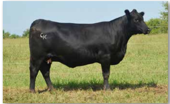
Lot 154 - CK Blkbird BRM/E740 G494