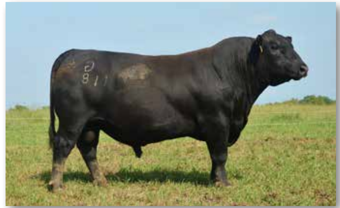
Lot 12 - CK Innovation A118G