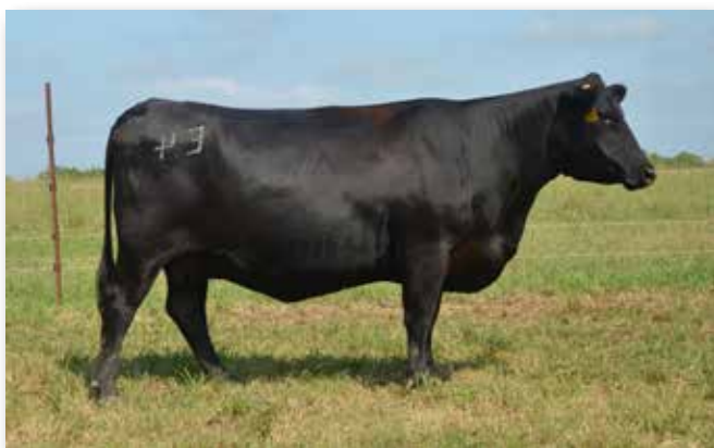
Lot 143 - CK Farrah GZ/B421 E4