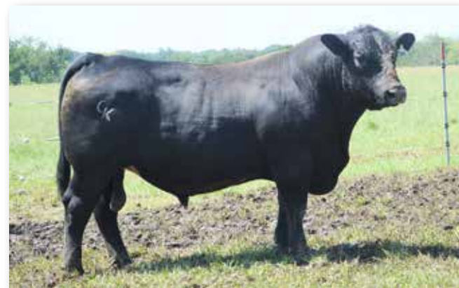
Lot 80 - CK Paleface E C243G