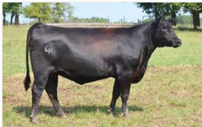
Lot 180 - CK Allison SSE/C322 G617