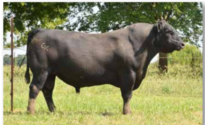
Lot 15 - CK D Fortress E757G