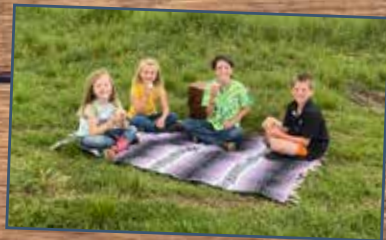
Cousin Crew Picnic