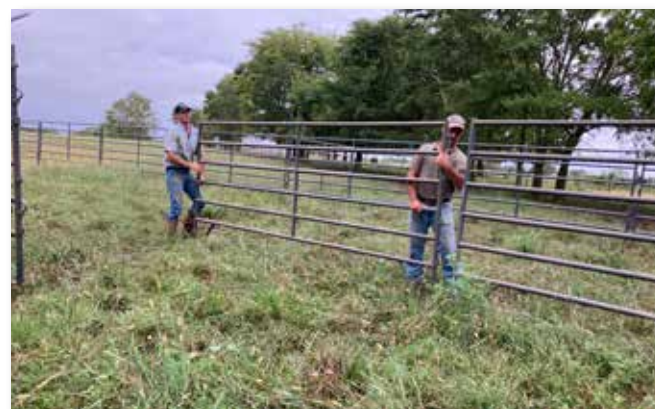
Getting panels up for the picture and video pen.