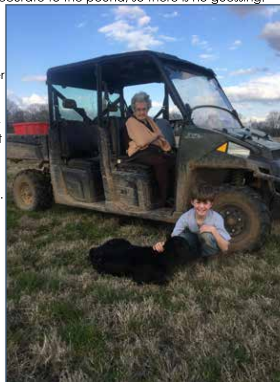
Chuck's Mom, "Bama", coming out to tag calves.