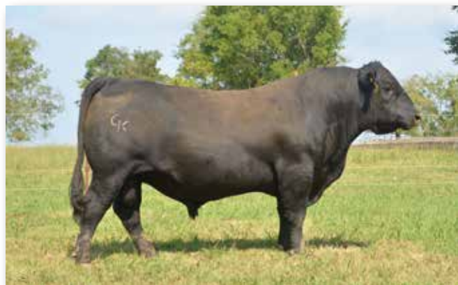
Lot 10 - CK Fortress/Z311 B429G