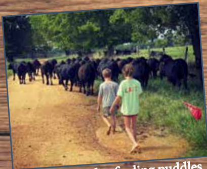
Hot summer day finding puddles