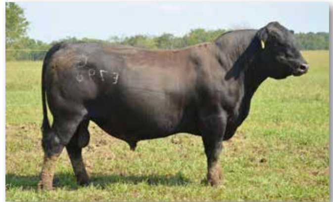
Lot 13 - CK Rainmaker E798G