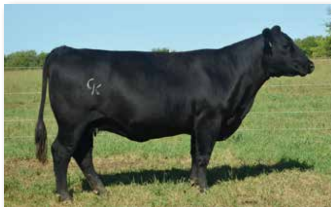
Lot 170 - CK Edella ARE/2506 D822