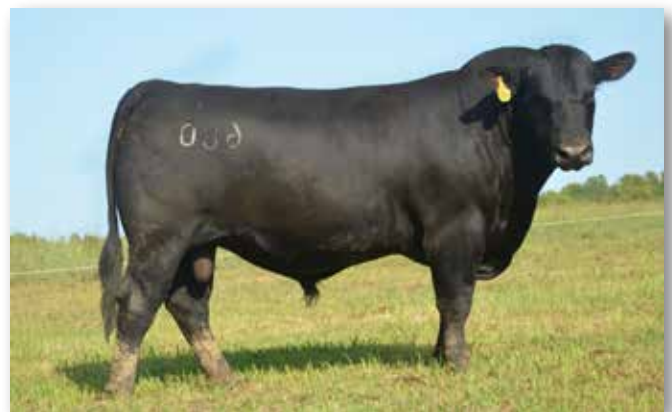
Lot 96 - CK Black Granite D680H