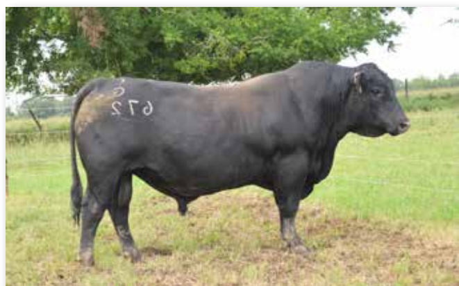
Lot 36 - CK Fort Benning D672G