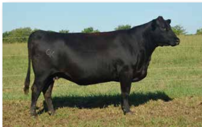
Lot 169 - CK Forlady AF/2430 D877