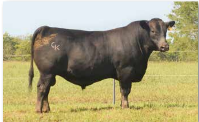
Lot 98 - CK Black Granite D685H