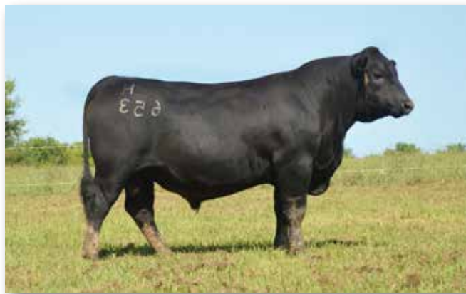
Lot 108 - CK Marshall Dillon D653H