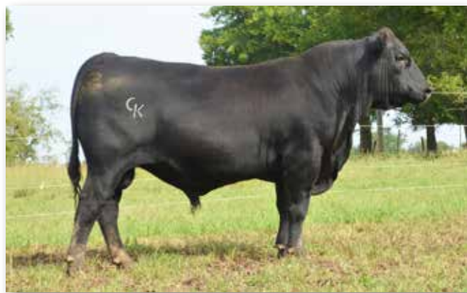
Lot 39 - CK Rawhide C547G