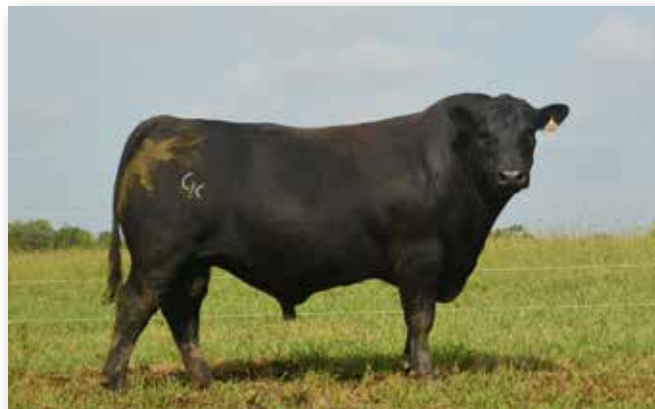
Lot 62 - CK Big Apple D890G