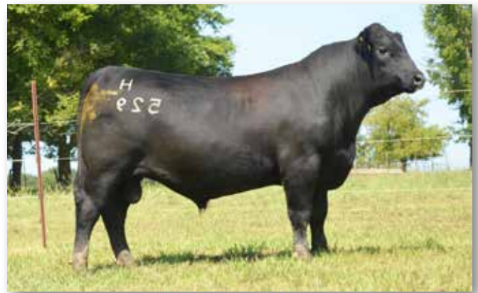
Lot 93 - CK C John Wayne C529H