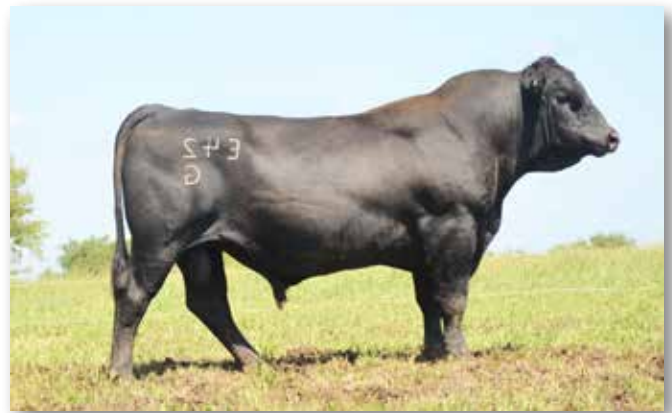
Lot 86 - CK Big Timber E42G