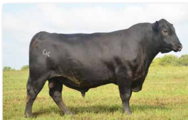
Lot 2 - CK Capitalist C165G