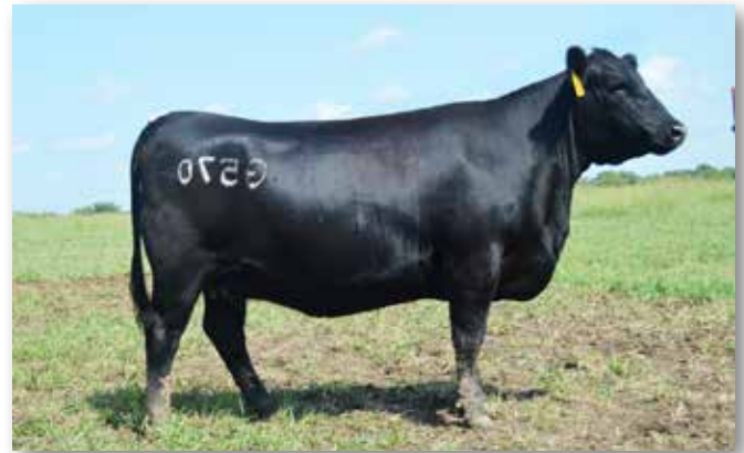
Lot 155 - CK F Lady RN/B487 G570