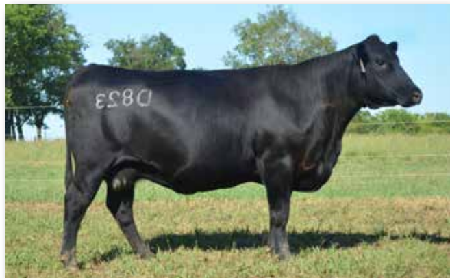
Lot 166 - CK Linda DK/4066 D823