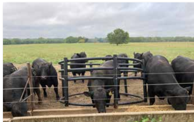
The typical Saturday morning. Bulls getting into trouble.