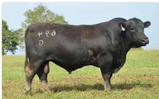
Lot 37 - CK Garrison D694G