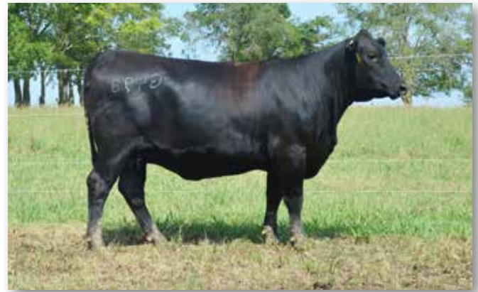
Lot 153 - CK Blkbird BRM/E744 G498