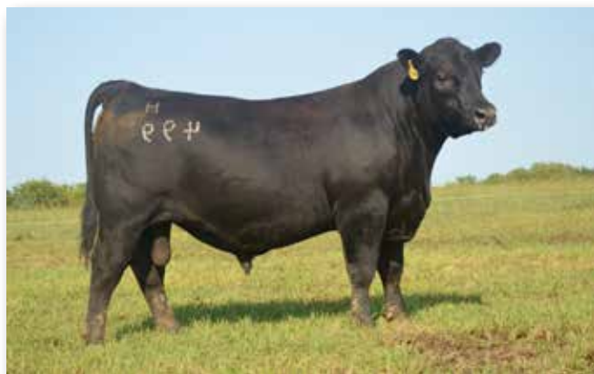
Lot 103 - CK Southern Charm C499H