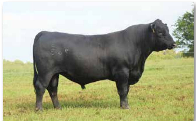
Lot 4 - CK Prophet E783G