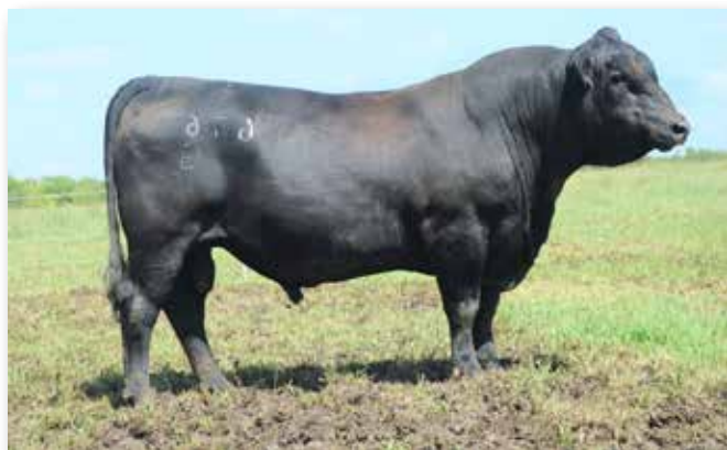
Lot 83 - CK Upgrade D 676G