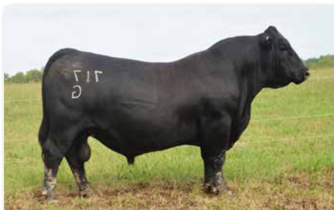
Lot 67 - CK Hoover Dam E E717G