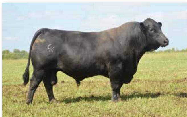
Lot 47 - CK Resource 1134G

CK 48 BULL ACA: 405474 BD: 10/07/2019 TATTOO: D822G