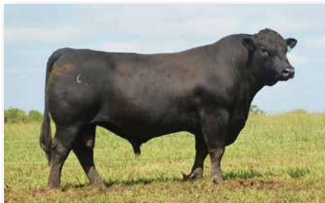
Lot 77 - CK Paleface E C247G