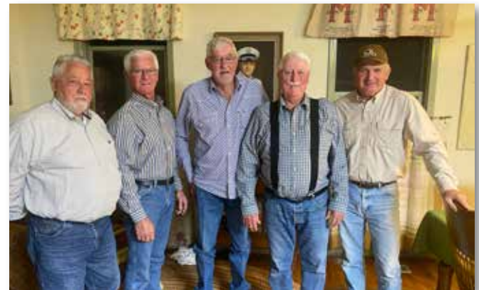
Old Friends visiting from South Dakota, Missouri, Tennessee and Georgia.