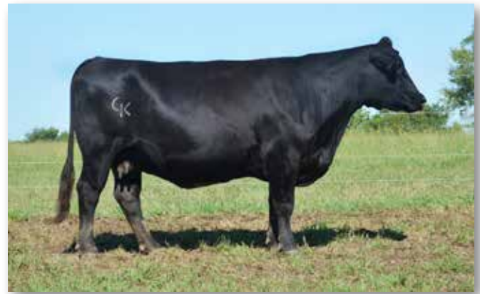
Lot 184 - CK Eurotia WC/035 D721