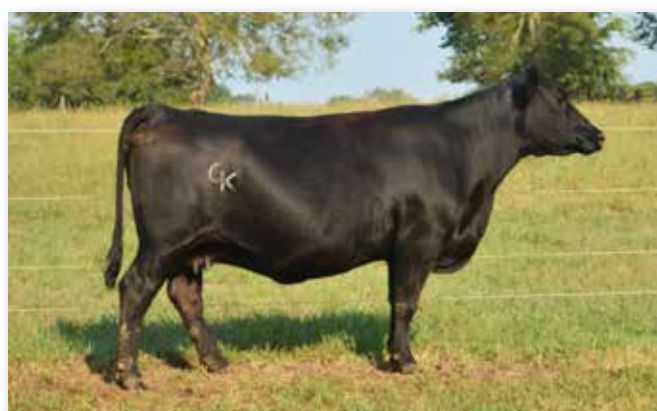
Lot 135 - CK Elita RA/B432 D648

• Production record of 3@102 WW, 2@103 YW, 1@129 IMF. • Safe to CK Rito 6EM3 3644E (AAA 18819806) with a heifer calf.