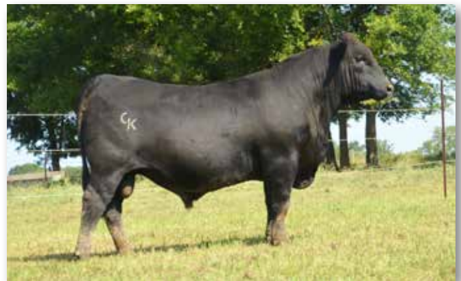
Lot 94 - CK C John Wayne C523H