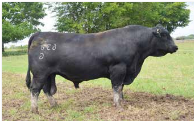
Lot 90 - CK Paleface E D638G