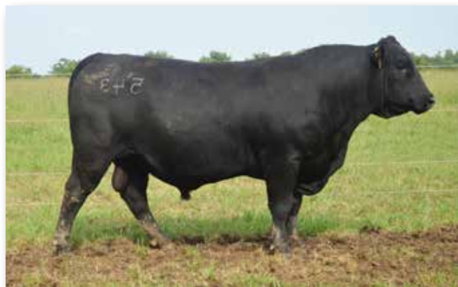
Lot 38 - CK Rawhide C543G