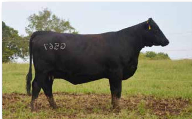
Lot 152 - CK Ms Pride BRM/583 G567