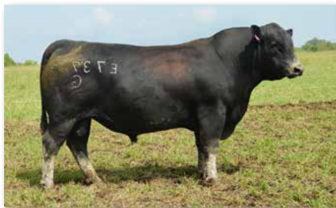
Lot 63 - CK Rainmaker E737G