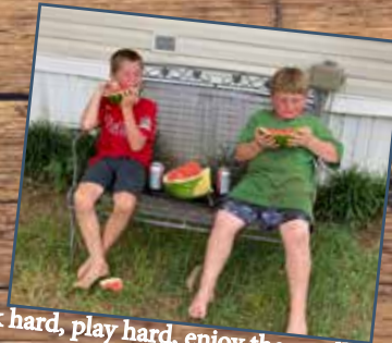
Work hard, play hard, enjoy the small things