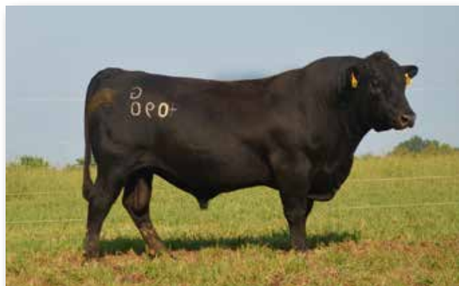
Lot 9 - CK Fortress/Z311 4090G