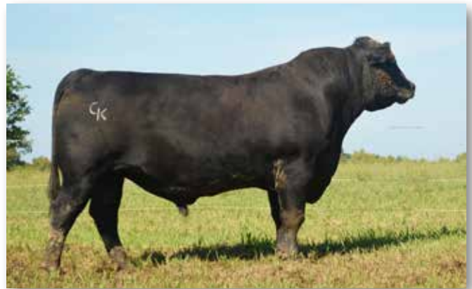
Lot 21 - CK Capitalist 267G