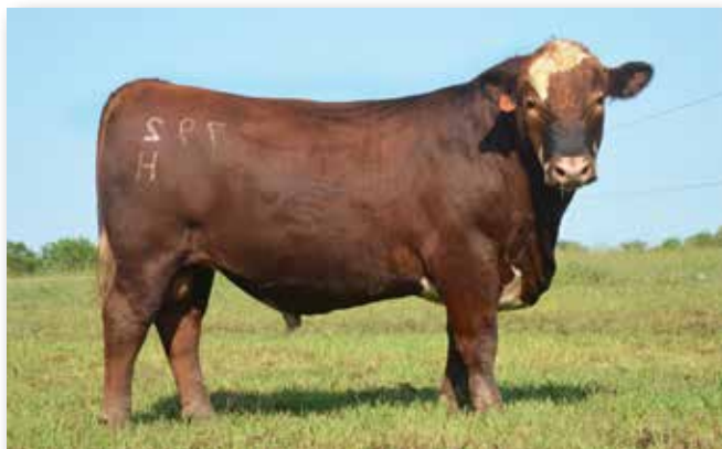
Lot 131 - CK Pacesetter D792H