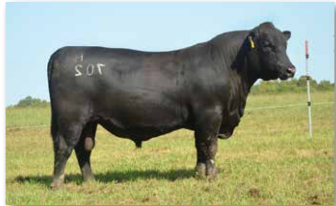
Lot 99 - CK Black Granite D702H