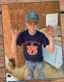
Not all jobs are fun!