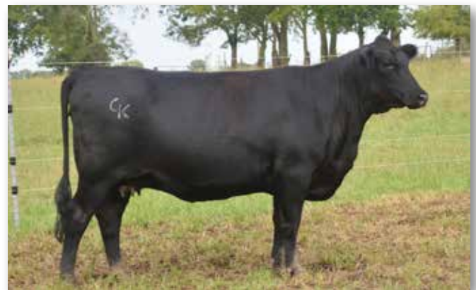
Lot 156 - CK Pride CHM/C581 G508