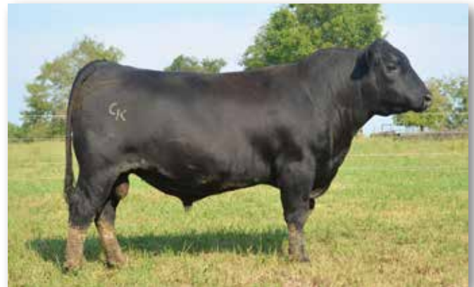
Lot 14 - CK C John Wayne E775G