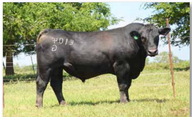
Lot 89 - CK United E104G