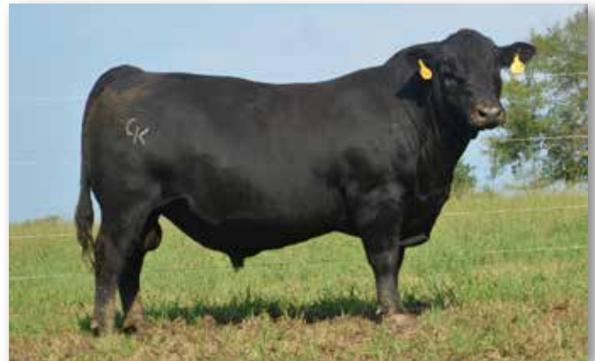
Lot 6 - CK Payweight/267 2410G