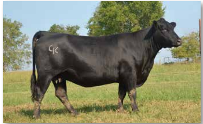
Lot 141 - CK Empress C39/B440 E33