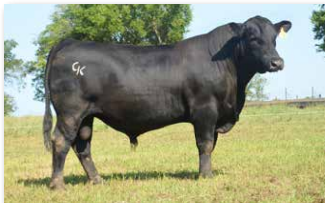
Lot 124 - CK Tahoe F76H