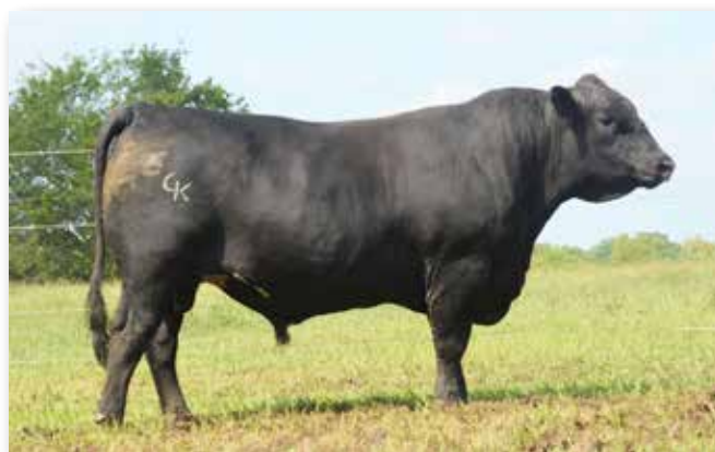
Lot 78 - CK Paleface E D782G