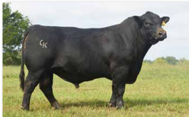
Lot 1 - CK Capitalist C573G