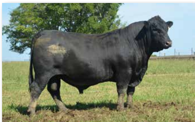
Lot 17 - CK Innovation 624G