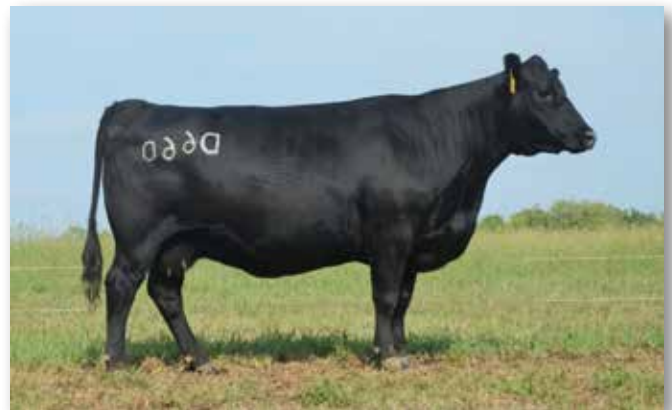
Lot 137 - CK Ms Pride AV/B409 D660

• Production record of 2@101 WW. • Safe to CK Marshall Dillon 311D (AAA 18786856) with a Heifer calf