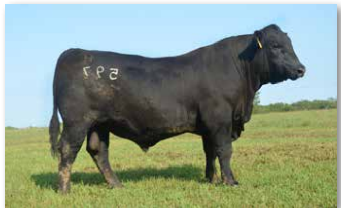
Lot 95 - CK Black Granite C597H