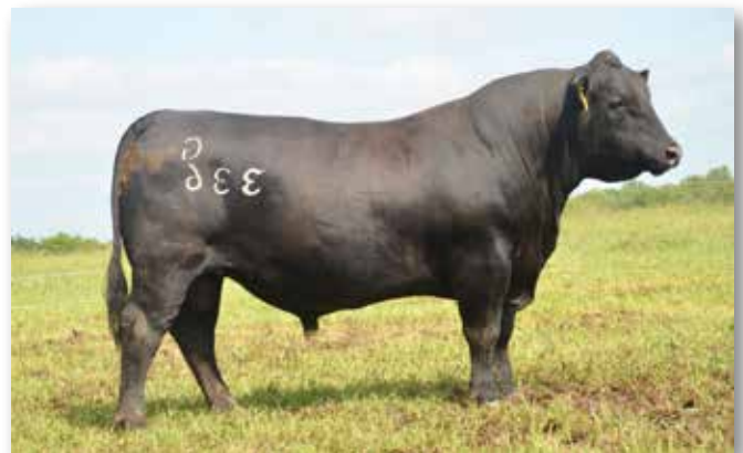
Lot 5 - CK Cheyenne Z336G