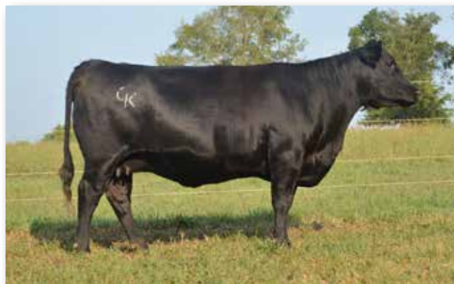
Lot 132 - CK Ettare RN/256 E747

• Safe to CK Marshall Dillon 311D (AAA 18786856) with a Heifer calf.