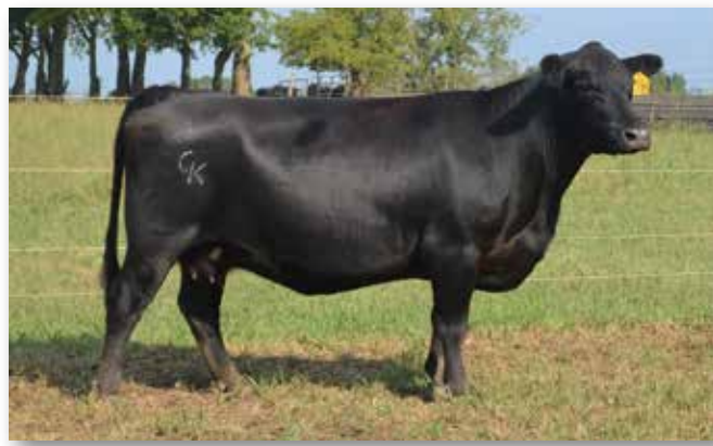
Lot 133 - CK Blkbird 6EM3/9 E739

• Safe to CK Marshall Dillon 311D (AAA 18786856) with a bull calf.