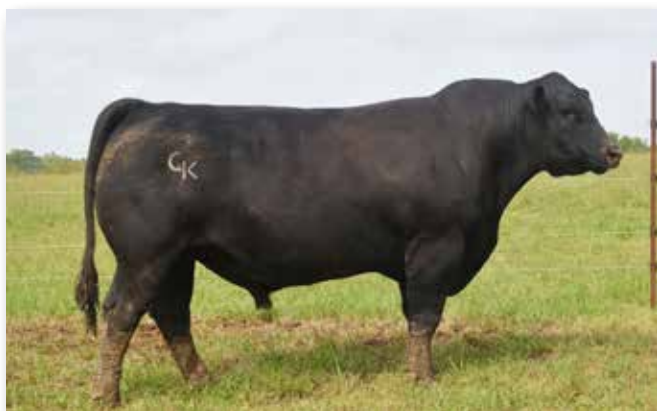
Lot 43 - CK Rainmaker E742G