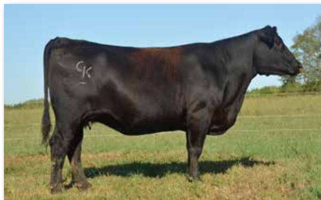
Lot 168 - CK Barbara CD/4127 E189