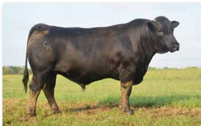
Lot 46 - CK Big Jake 4154G

CK 47 BULL ACA: 405502 BD: 10/21/2019 TATTOO: 1134G