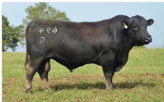
Lot 66 - CK Big Apple 694G