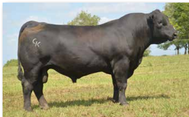
Lot 48 - CK Big Bend D822G