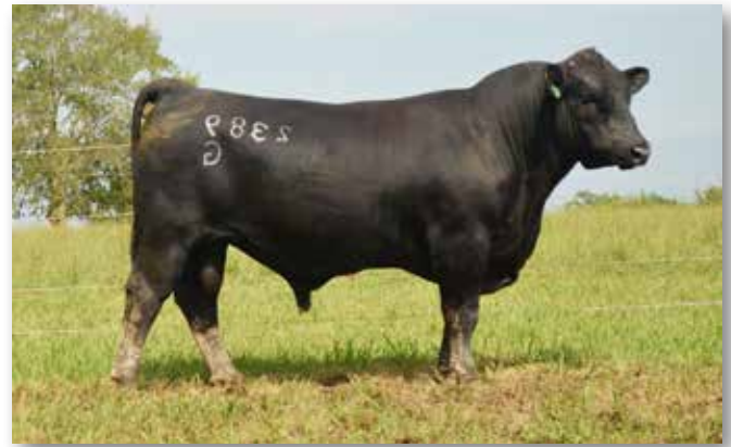
Lot 56 - CK DCL406 2389G