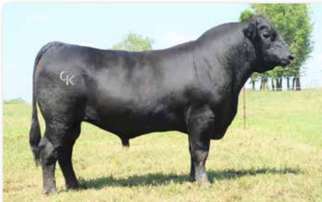
Lot 84 - CK Johnny Morrow E 4132G