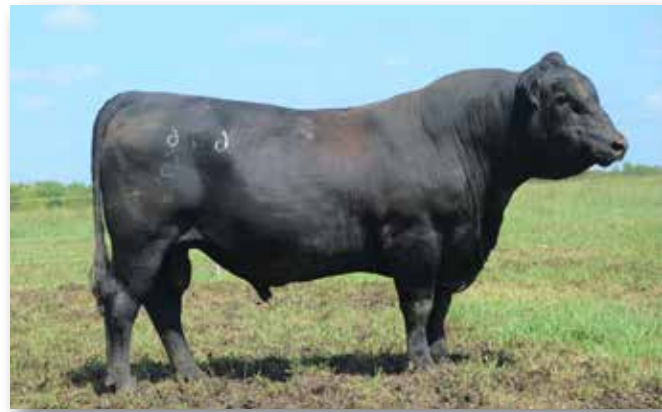
Lot 35 - CK Fort Benning D676G