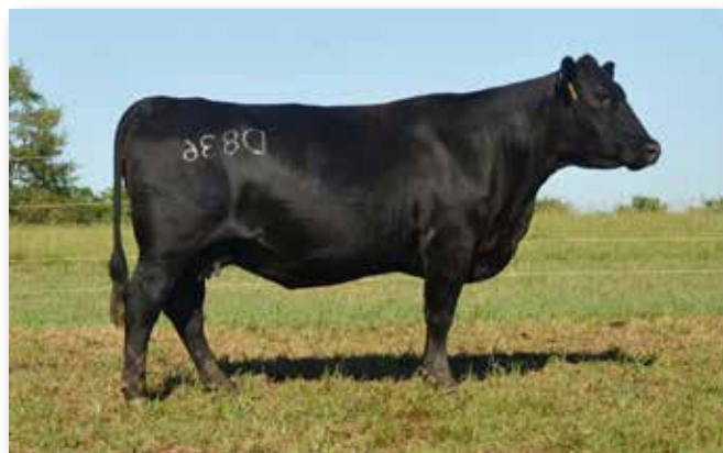
Lot 165 - CK Barbie PF/543 D836

(ACA 401011), who was the top selling Chiangus bull from the 2020 HQS Sale. 1/2 interest in this bull sold to fellow breeder Dennis Clarahan of Harper, Iowa for $7,750.