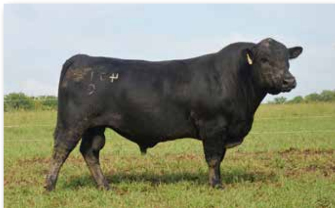
Lot 55 - CK DCL406 2471G