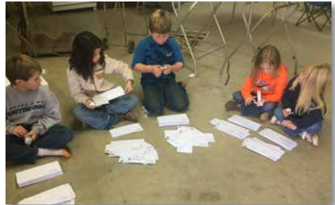
Making good use of all the hands. If your mail is a little crooked just know the stickers are put on with love.