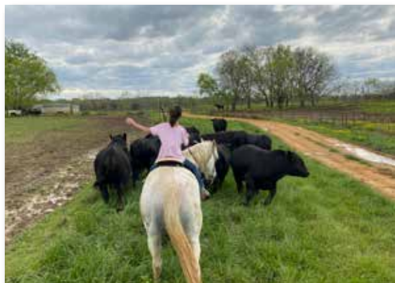
Ellis Ann on Big Mike moving bulls. The kids are beginning to be real big assets here!

At yearling we collect weights, scrotal, frame and ultrasound data. All yearling bulls are freeze branded in December. It is then we select the group of bulls we will be using in our program as yearlings. All yearlings used on the CK Cattle operation will be returned to our bull development program after being pulled at the end of the breeding season. These bulls will then be offered for sale at 2 years of age at our Headquarters sale. We will provide a footnote in the catalog on any bull used in our program as a yearling. We are continually culling bulls. Some soundness and feet issues really start to appear at around 15-18 months. This is another big plus for buying two year olds bulls, as it is very difficult to see some these issues before the bulls have a chance to fully mature. All bulls are trich tested and will have passed a bull soundness evaluation within 30 days prior to October 29 th , 2021.