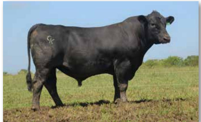
Lot 88 - CK Graduate E127G