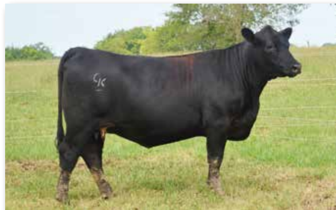
Lot 179 - LBE Ellie 5322D/4174 G959