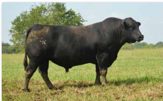
Lot 59 - CK Big Bend D824G