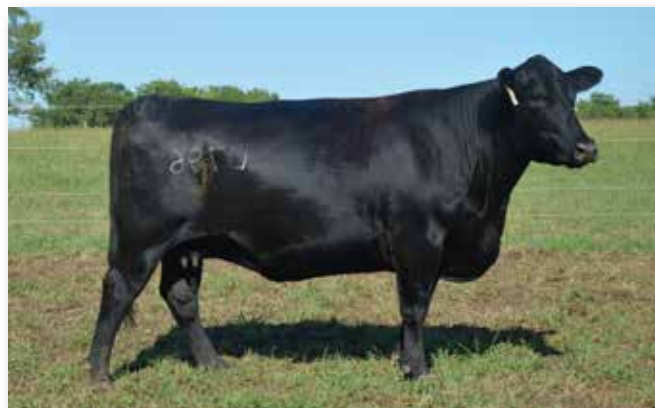
Lot 171 - CK Barbara PP/419 D796