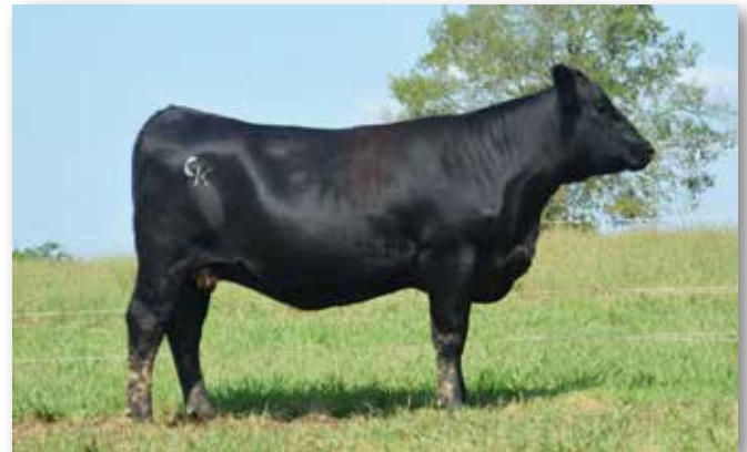
Lot 188 - CK Wardess GD/E749 G604