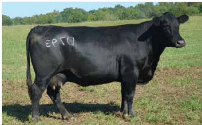
Lot 167 - CK Misty PP/311 D793

sired by CK Density 305D (ACA 389820), birthweight 80 pounds.