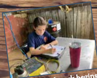
Now the real work begins