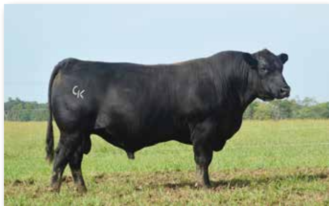
Lot 40 - CK Rawhide C554G