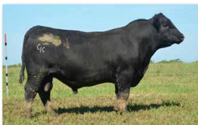
Lot 18 - CK Innovation B340G

• Virgin Bull. • His Pathfinder dam holds a production record of 4@108 WW, 4@107 YW with a 356 day calving interval.