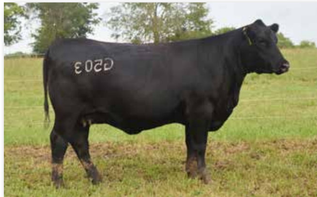
Lot 158 - CK Ms Pride CHYE/A123 G503