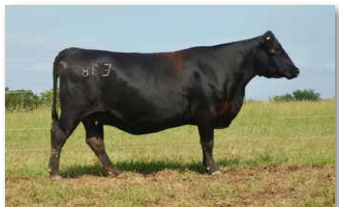
Lot 139 - CK Blkberry C5/118 E38