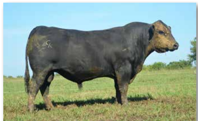
Lot 24 - CK Rawhide C585G