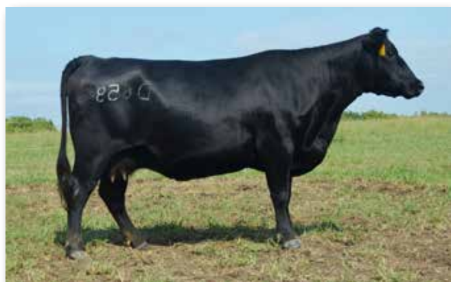
Lot 134 - CK Eurotia AV/B441 D658

• A.I.'d 12/23/20 to Tehama Patriarch. • Safe to Patriarch with a bull calf.