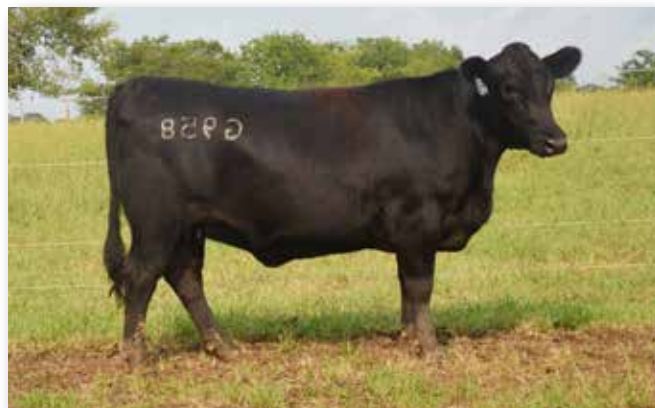
Lot 181 - LBE Betty D406/806 G958