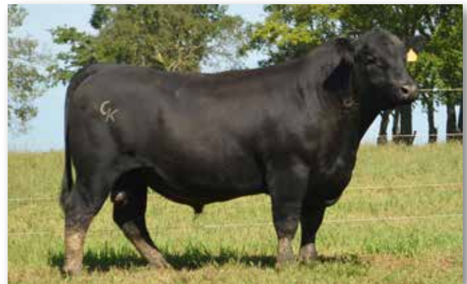
Lot 22 - CK Capitalist E25G