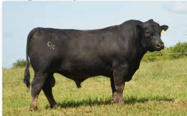
Lot 25 - CK C John Wayne 347G