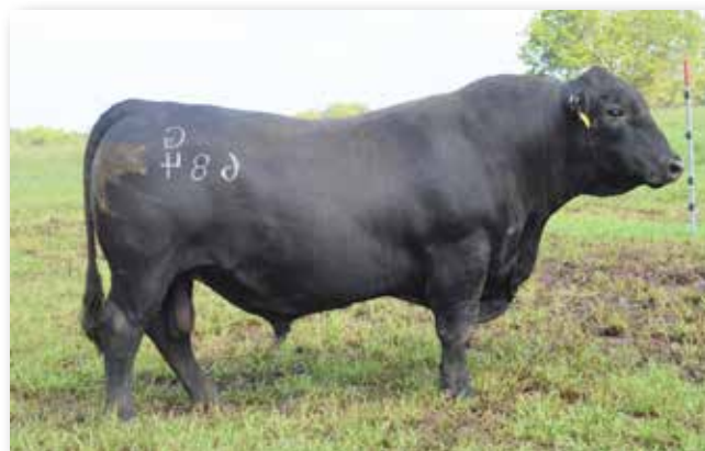
Lot 3 - CK Fort Benning D684G

All bulls picked up WEEKEND OF SALE will receive a $50 discount, up to $100 max. per customer.