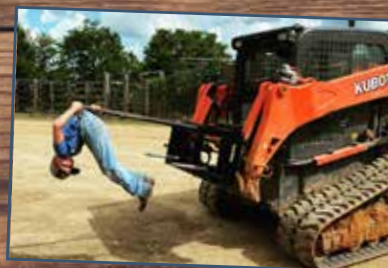
Trouble in Paradise