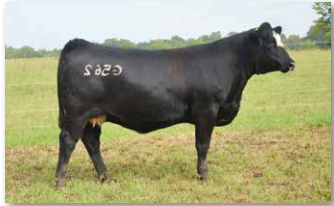
Lot 189 - CK Rita LG/C553 G562