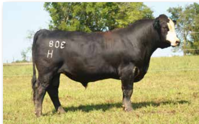
Lot 130 - CK Broadway C308H