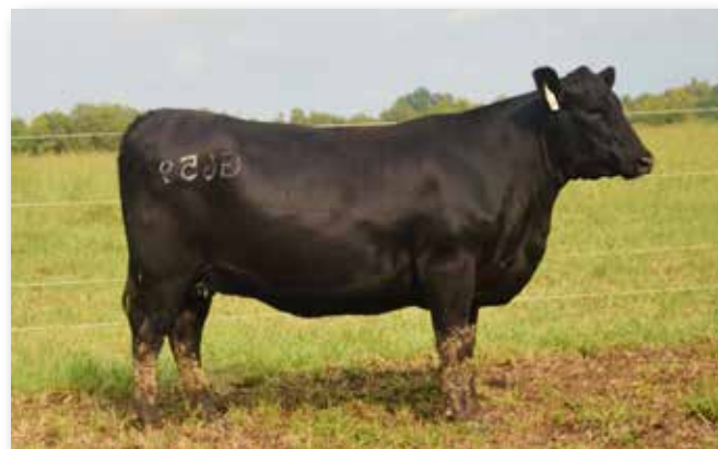
Lot 178 - CK Ellie RS/2400 G659