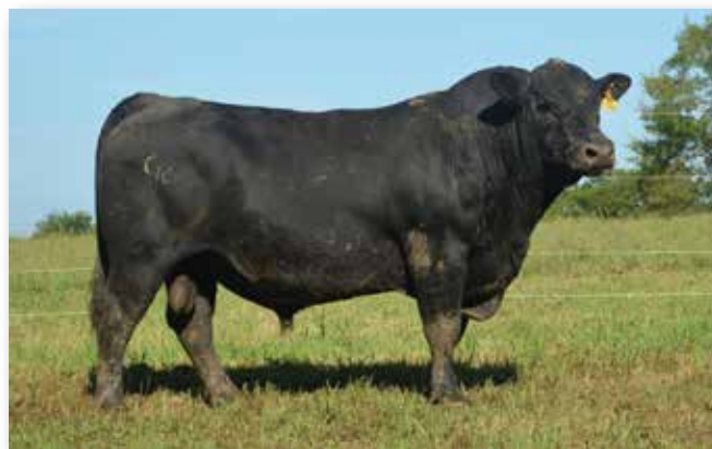
Lot 20 - CK Capitalist E31G

• Virgin Bull. • His dam holds a production record of 2@104 WW, 1@107 YW.