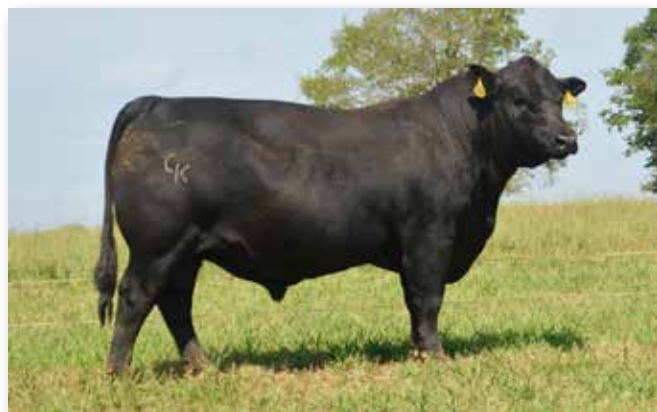
Lot 8 - CK Payweight/267 3618G