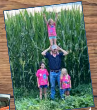
Plenty of rain made a good corn crop