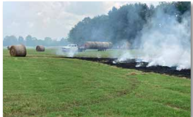
WET HAY - The story of 2021. This low spot never would dry out to bale and had to be burned.