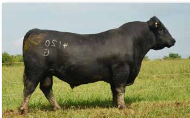
Lot 52 - CK Resource 4120G