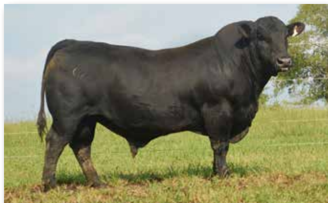
Lot 50 - CK Resource 3615G