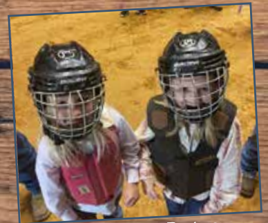
Cute Muttin Busters