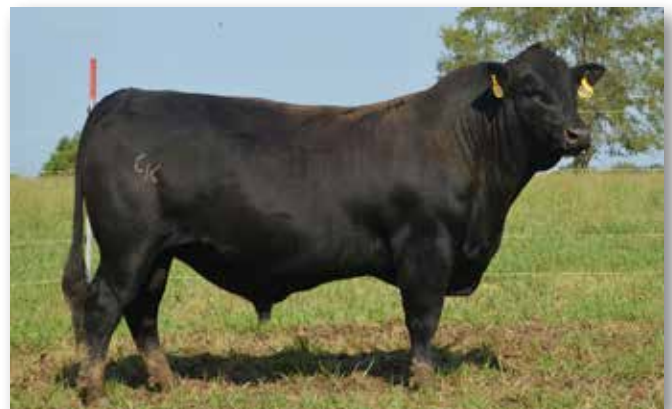
Lot 7 - CK Payweight/267 3616G