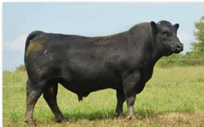
Lot 51 - CK Resource 4112G