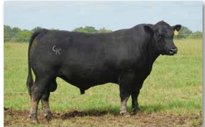
Lot 42 - CK D Fortress E746G