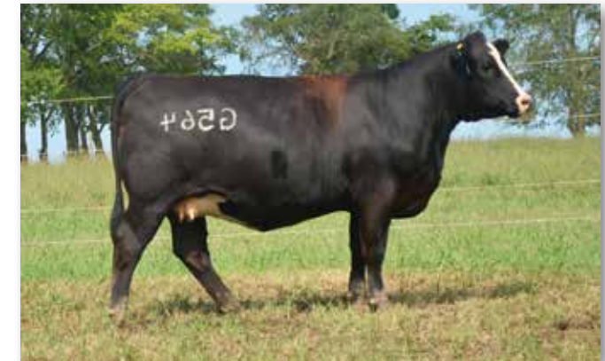
Lot 190 - CK Duchess LG/Z300 G564